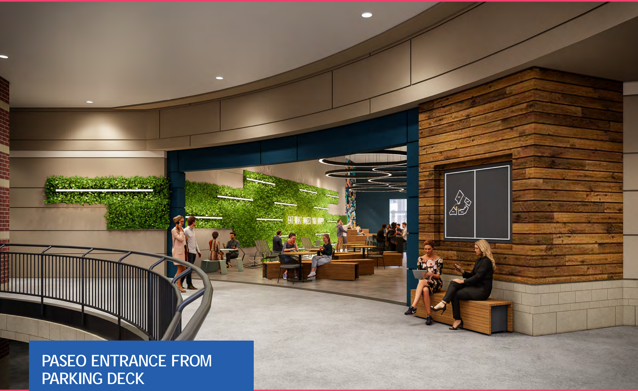
PASEO ENTRANCE FROM PARKING DECK