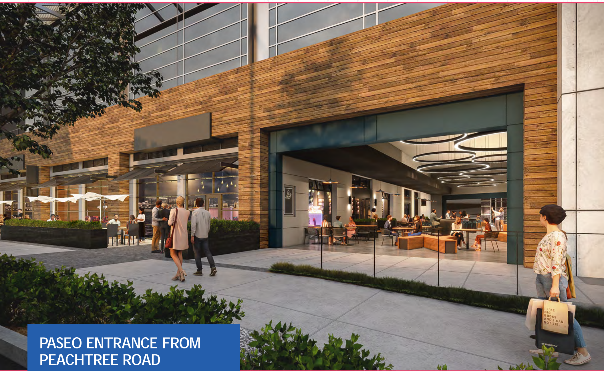
PASEO ENTRANCE FROM PEACHTREE ROAD